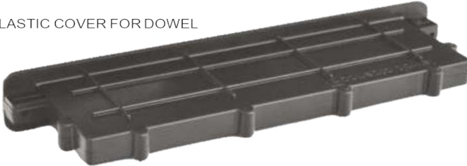
PLASTIC COVER FOR DOWEL

Dowel system are designed to create expansion joints for industrial. Steel armoured joints with their unique construction constitute a stay-in-place formwork and additionally secure concrete floor edges. Dowel system is a floor expansion joint solution, where an anchoring element is a steel dowel placed in a specifically designed plastic sleeve, which permits free horizontal movement (along and across of expansion joints) and prevents vertical movements between expanded floor plates. Plastic elements are provided with proper reinforcements, which protect them against the deformation caused by the concrete pressure (even when the floor is thick).